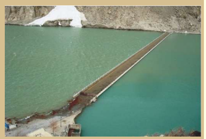
Submerged Shishkat-Gulmit Bridge