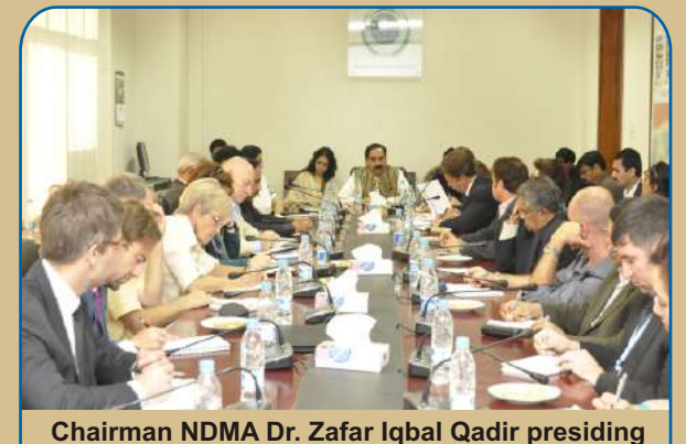
over the 8th Policy Coordination Meeting.

He further suggested that a sub-committee be formed to assess and ensure the availability and security of relief goods.