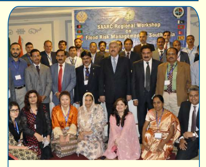
A Group photo of the participants of "SAARC Workshop on Flood Risk Management in South Asia" with the chief guest Rana M. Farooq Saeed Khan, Federal Minister for Climate Change.

Rana Muhammad Farooq Saeed Khan, the Federal Minister for Climate Change opening ceremony as the Chief Guest. He said that South Asian countries are facing the flooding problem because of the climate change and occurrence of floods has been seen increasing both in frequency and magnitude over the years. He stressed on the collaborative effort from the SDMC for a more rigorous approach toward disaster management at regional level.